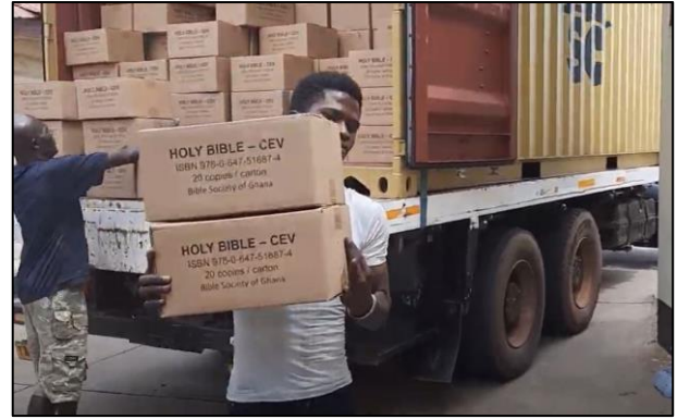
The handover and unloading of 20,000 Bibles in Ghana at the end of 2020

Last time I spoke to you we had requests for 80,000 Bibles for Angola. Angola is shown on the left hand lower side of the map and is an extension of the southern Bible Belt. The Angolan project is being implemented in a different way from other projects. We have worked with the Angola Bible Society to write a submission to the United Bible Society (International Projects) in which Operation Africa will fund 50% of the project and the United Bible Society will fund the other 50%. We have made this initial project only 10,000 Bibles to prove the model and establish that the Bibles can be successfully distributed throughout the Angolan military. Please pray that the United Bible Society is prepared to partner with Operation Africa, because it makes the project twice as effective in terms of the number Bibles distributed. The Angola Bible Society leader is very excited by this project. She reports that it has given them “energy”.